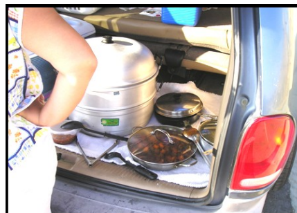
Unpermitted Food Vendor Selling Out of a Car