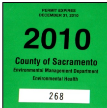
An Example of a Permit

A permitted mobile food vendor must comply with California Health and Safety Code requirements.